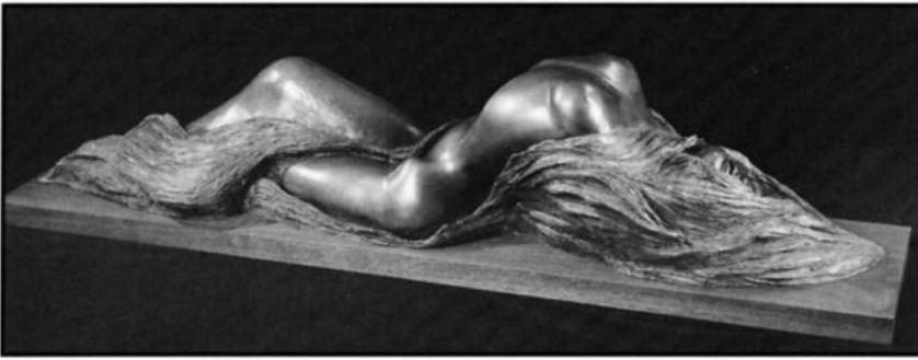
Two views of 'Sea Embrace' 3/4 Life Size 13x60x15 Bronze