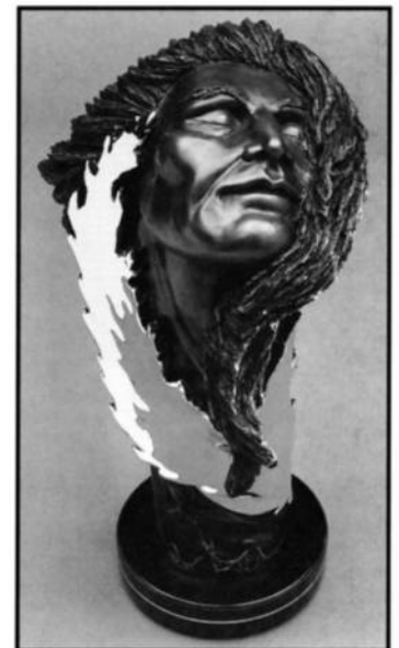
'Sun Dances' Life Size 13x13x23 Bronze (Pictured in color on reverse side)