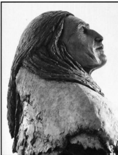
'The Prophecy' 1-1/2 Life Size 18x28x31 Bronze