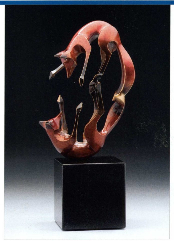
▲ Laurel Peterson Gregory, Rambunction, bronze, 17 x 8 x 5. ▶ J. Christopher White, Majesty on High, bronze/wood, h14.

allowed the arts council to install four new sculptures in the expansive, grassy park this summer.