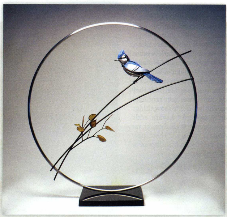
▲ Don Rambadt, Fall Colors, bronze/stainless steel/gold leaf, 33 x 32 x 12.

◆ Paddi Moyer, Awakening, cast powdered stone, 17 x 19 x 10.